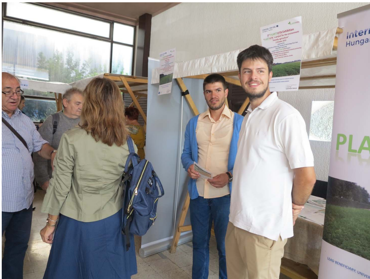
Discussion with participants during 3rd PLANTSVITA Exhibition