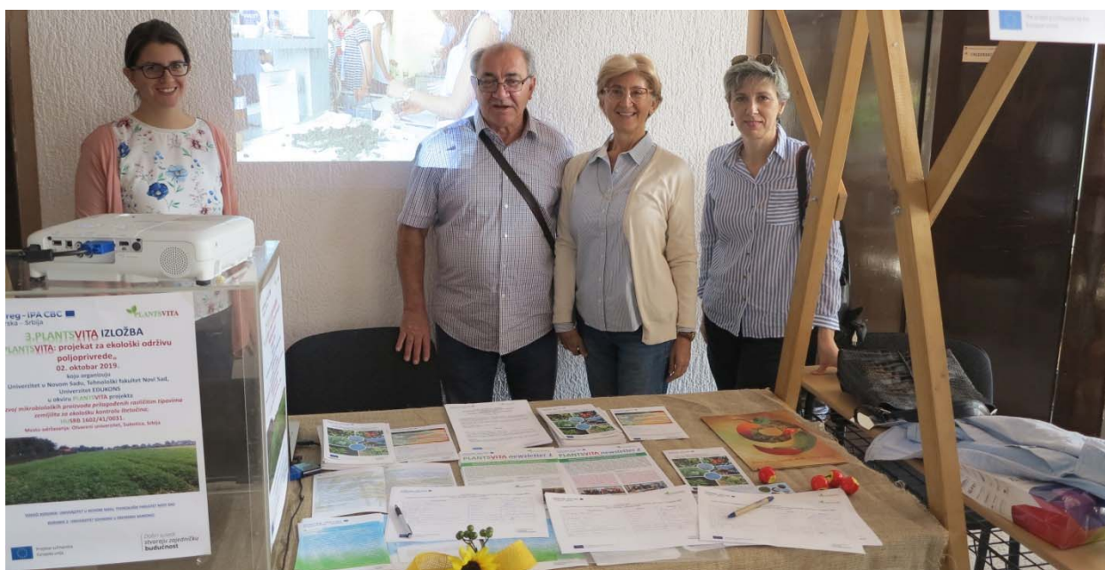
Members of the PLANSTVITA project behind the project stand during 3rd PLANTSVITA Exhibition