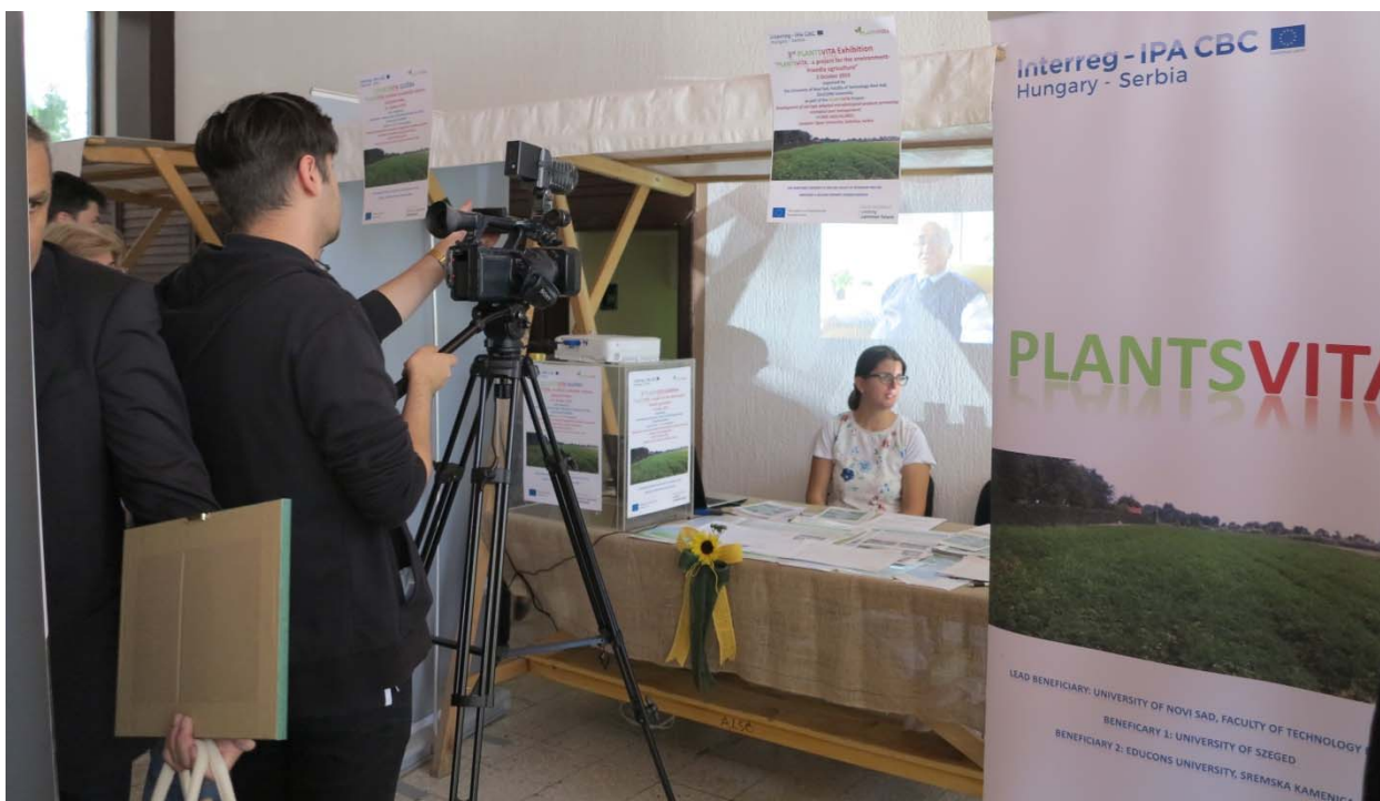
Recording of the report on the PLANTSVITA project during 3rd PLANTSVITA Exhibition