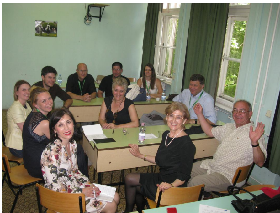
PLANTSVITA project participants during the round-table discussion

This document has been produced with the financial assistance of the European Union. The content of the document is the sole responsibility of Department of Microbiology, FSI, University of Szeged, Hungary, and can under no circumstances be regarded as reflecting the position of the European Union and/or the Managing Authority.